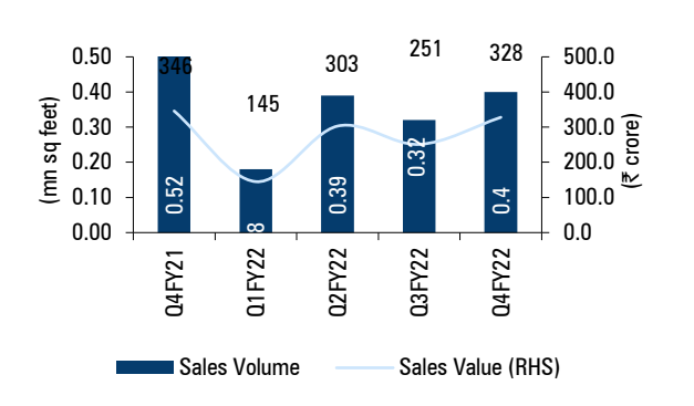
Exhibit 2: Quarterly collection