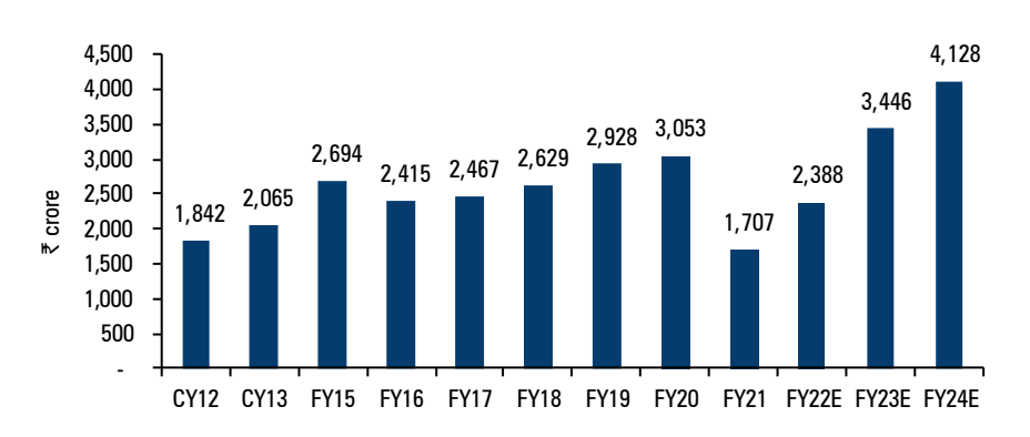
Exhibit 3: Revenue trend