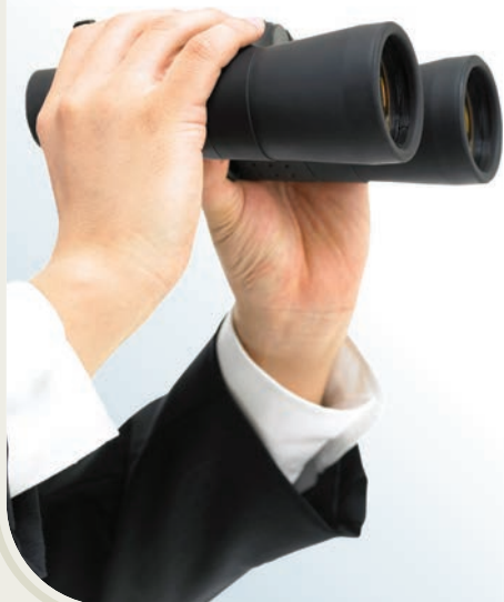
A career in high demand: